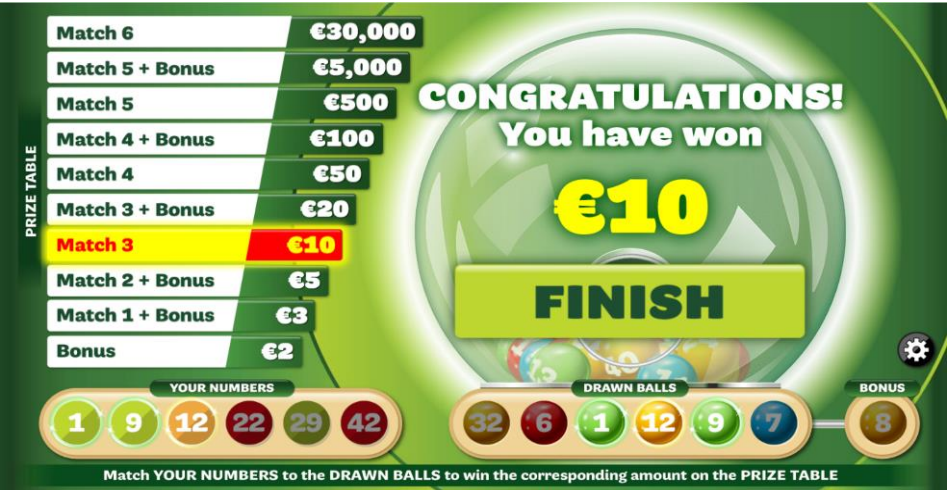
Please see above an example of an end winning play

8) Once the Player has played, a message indicating the result will appear: