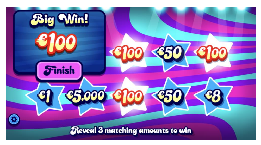
Please see above an example of an end winning play